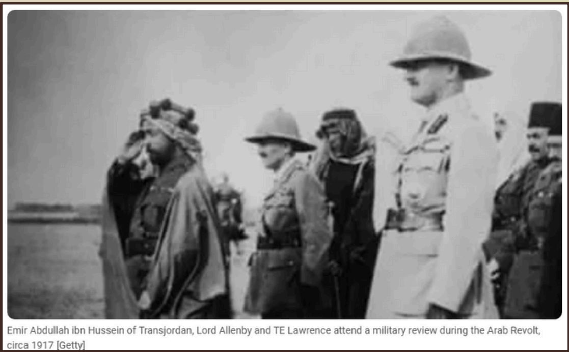
Emir Abdullah ibn Hussein of Transjordan, Lord Allenby and TE Lawrence attend a military review during the Arab Revolt, circa 1917

1915-16 Hussein-McMahon Correspondence Britain promises Arab independence for WWI revolt.